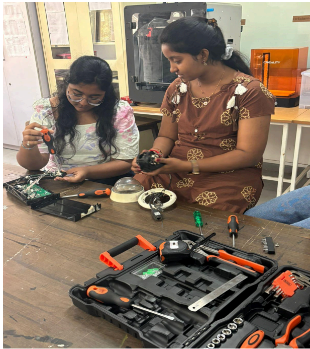
3D Scanning and Disassembly of components